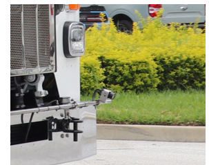
EXTRA MONITORS, CAMERAS, 360 SYSTEM