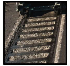
LIMITED TRADITIONAL RUMBLES