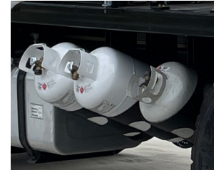
PROPANE TANK HOLDERS