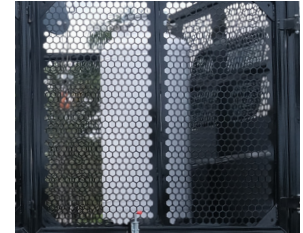
1,500 LB. BEAD TANK