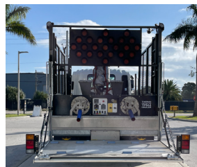
REAR LIFT DECK