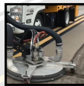
AIRPORT APRON CLEANING