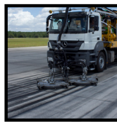
RUNWAY RUBBER REMOVAL