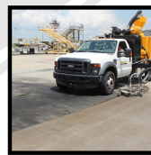
HYDRAULIC SPILL CLEANUP