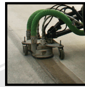
CURING COMPOUND REMOVAL