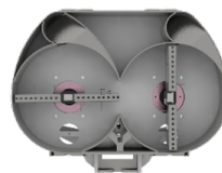
24" TWIN HEAD