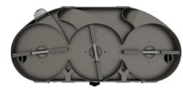
48" TRIPLE HEAD