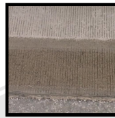
CURING COMPOUND REMOVAL