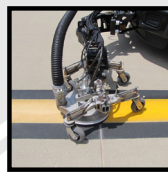
PAINT CLEANING & REJUVENATION