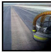
RUNWAY RUBBER REMOVAL