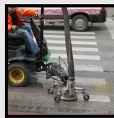
CLEAN GORE AREAS, TURN ARROWS, ETC.