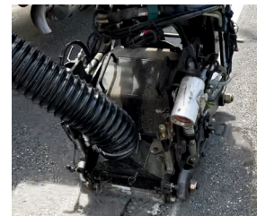
18" CUTTER DRUM