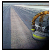
RUNWAY RUBBER REMOVAL