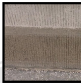
CURING COMPOUND REMOVAL