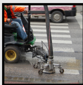
CLEAN GORE AREAS, TURN ARROWS, ETC.