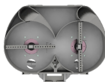
24" TWIN HEAD