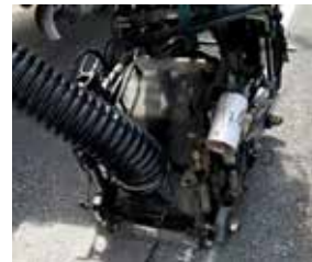
18" CUTTER DRUM