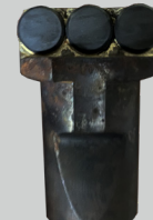
TRIPLE ROUND (FLAT ONLY)